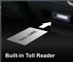
Built-in Toll Reader