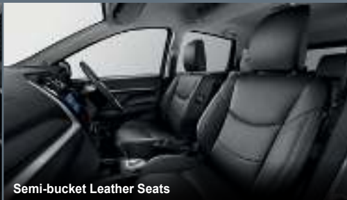
Semi-bucket Leather Seats