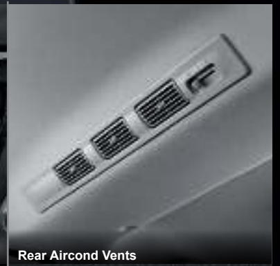
Rear Aircond Vents