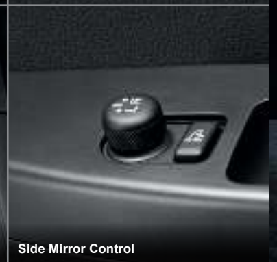
Side Mirror Control