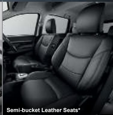
Semi-bucket Leather Seats*