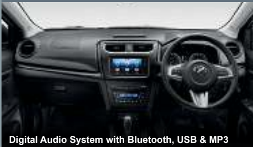
Digital Audio System with Bluetooth, USB & MP3