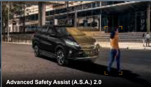
Advanced Safety Assist (A.S.A.) 2.0