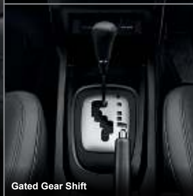
Gated Gear Shift