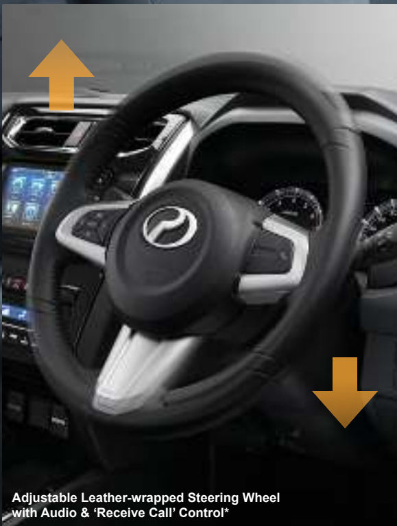
Adjustable Leather-wrapped Steering Wheel with Audio & 'Receive Call' Control*