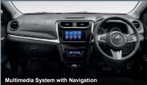
Multimedia System with Navigation