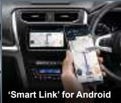
'Smart Link' for Android