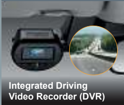
Integrated Driving Video Recorder (DVR)