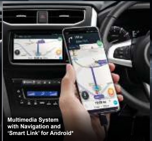
Multimedia System with Navigation and 'Smart Link' for Android*