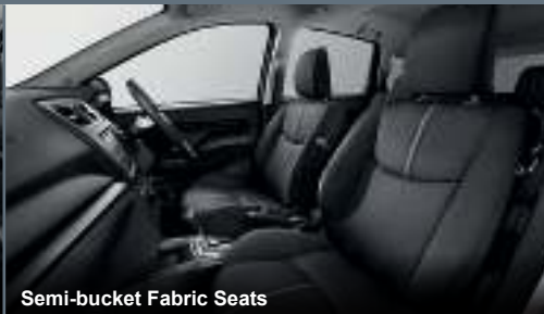
Semi-bucket Fabric Seats