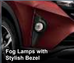
Fog Lamps with Stylish Bezel