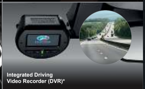
Integrated Driving Video Recorder (DVR)*