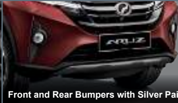
Front and Rear Bumpers with Silver Painted Diffuser