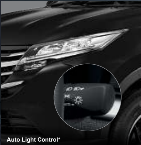
Auto Light Control*