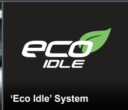
'Eco Idle' System